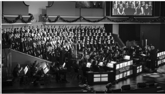
The Worship Choir